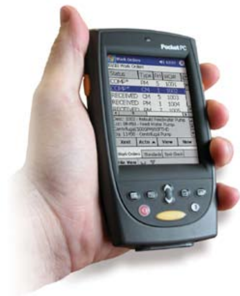
Use mobile devices to generate work orders and check their status from the field.