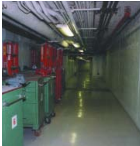
Work in and out of wireless coverage, depending on its availability.